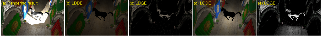
Figure 1: Rendering result (a) using two VSGLs, and its decomposed images (b)(c)(d)(e) for each light path (264 k triangles scene, minimum roughness: 0.04, resolution: 1920 \times 1080 , GPU: AMD Radeon™ R9 290X). Our method roughly approximates one-bounce glossy indirect illumination including caustics paths (d)(e) for scenes lit by a spot light. The computation time of indirect illumination is 0.7 ms (RSM: 0.224 ms, VSGL generation: 0.063 ms, shading: 0.407 ms).

Introduction. A virtual spherical Gaussian light (VSGL) [Tokuyoshi 2015] is an approximation of a set of virtual point lights (VPLs) for real-time rendering. Thousands of VSGLs can be dynamically generated using mipmapped specialized reflective shadow maps (RSMs) to render glossy indirect illumination at 20-30 ms. Although this approach is efficient compared to VPLs, rendering at 20-30 ms is still expensive for some time-sensitive applications such as video games. This poster demonstrates glossy indirect illumination in 1 ms using only two VSGLs. In this poster, each VSGL has a single spherical Gaussian lobe to represent radiant intensity, and thus diffuse and specular reflections at the second bounce are represented with two VSGLs. This rough approximation is suitable for scenes which are locally lit by a spot light (e.g., flashlight in a cave). To generate these two VSGLs dynamically, this poster presents a specialized implementation using a parallel summation algorithm. Other than RSMs, our implementation uses only small temporary buffers with a resolution that is 1/64 of an RSM. Therefore, the proposed method is not only fast, but also memory saving.